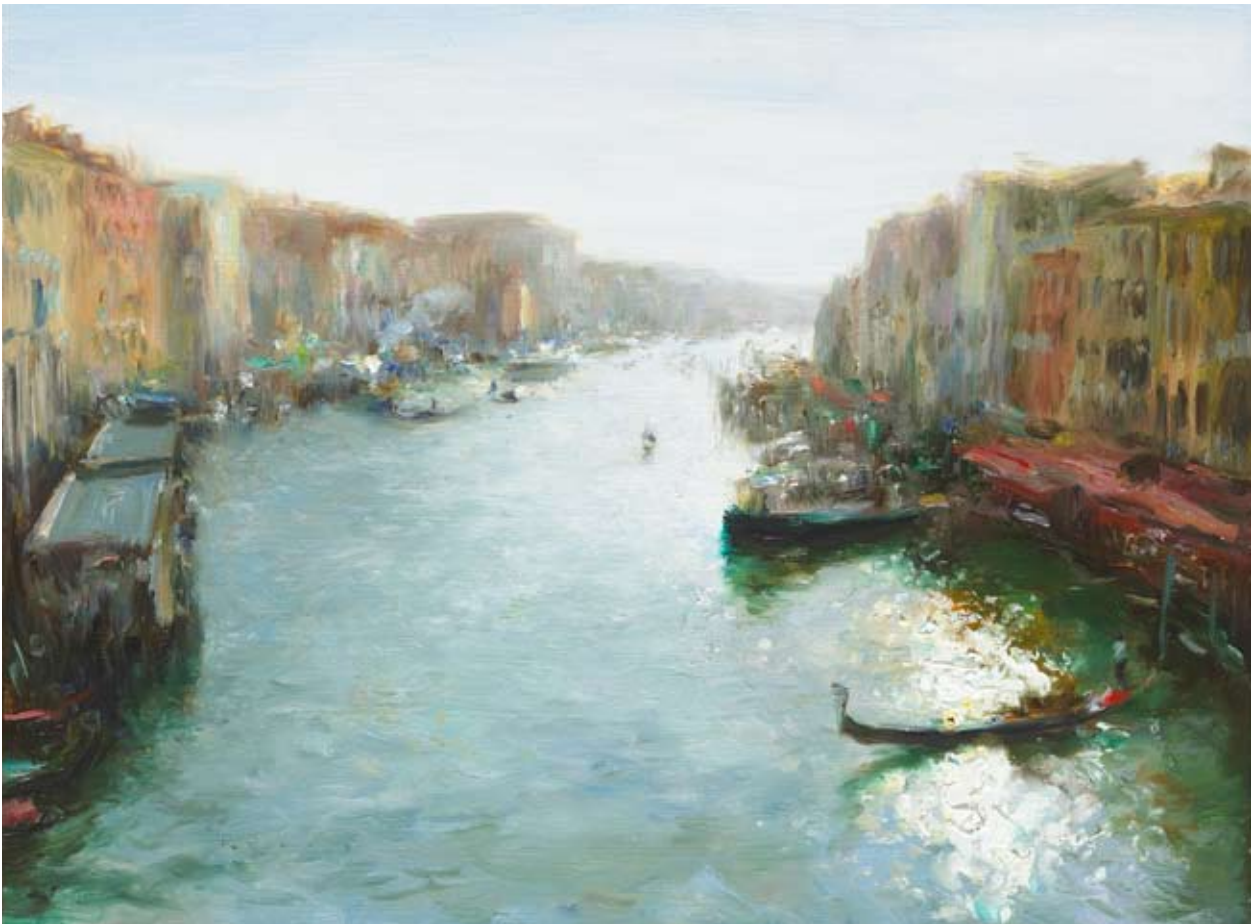
4. VIEW FROM RIALTO BRIDGE, VENICE