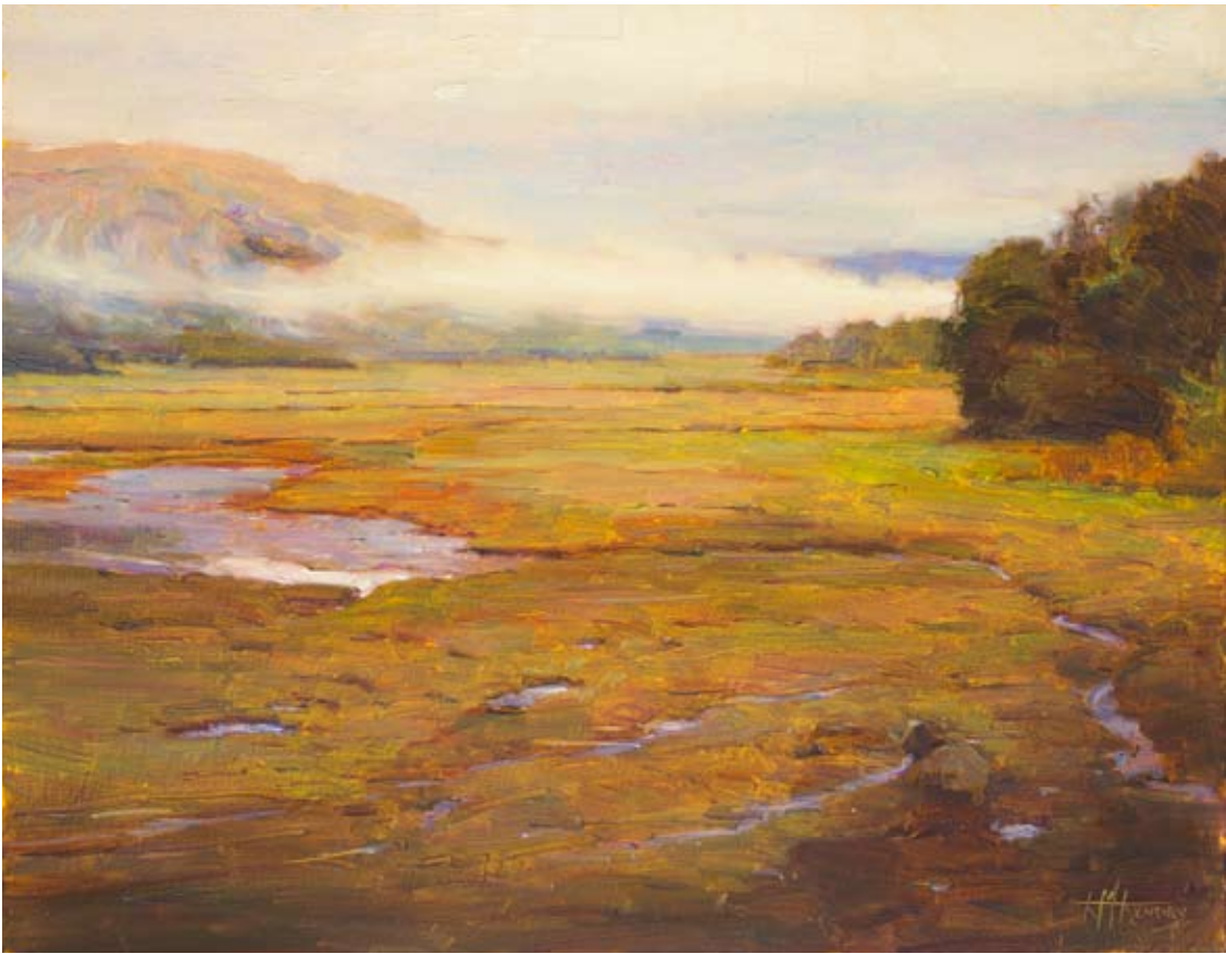
7. MARSHLANDS, MORNING