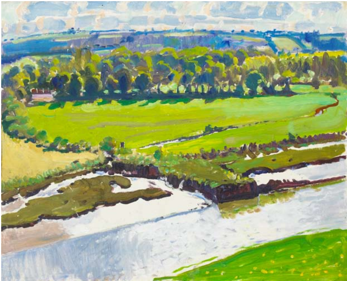
18. TOURIG RIVER, YOUGHAL

Paintings by him are in the permanent collections of the Crawford Municipal Art Gallery, Cork; Limerick City Gallery of Art; Mary Immaculate College, Limerick; National Collection of Contemporary Drawings, L.C.G.A., University of Limerick and private collections throughout Ireland