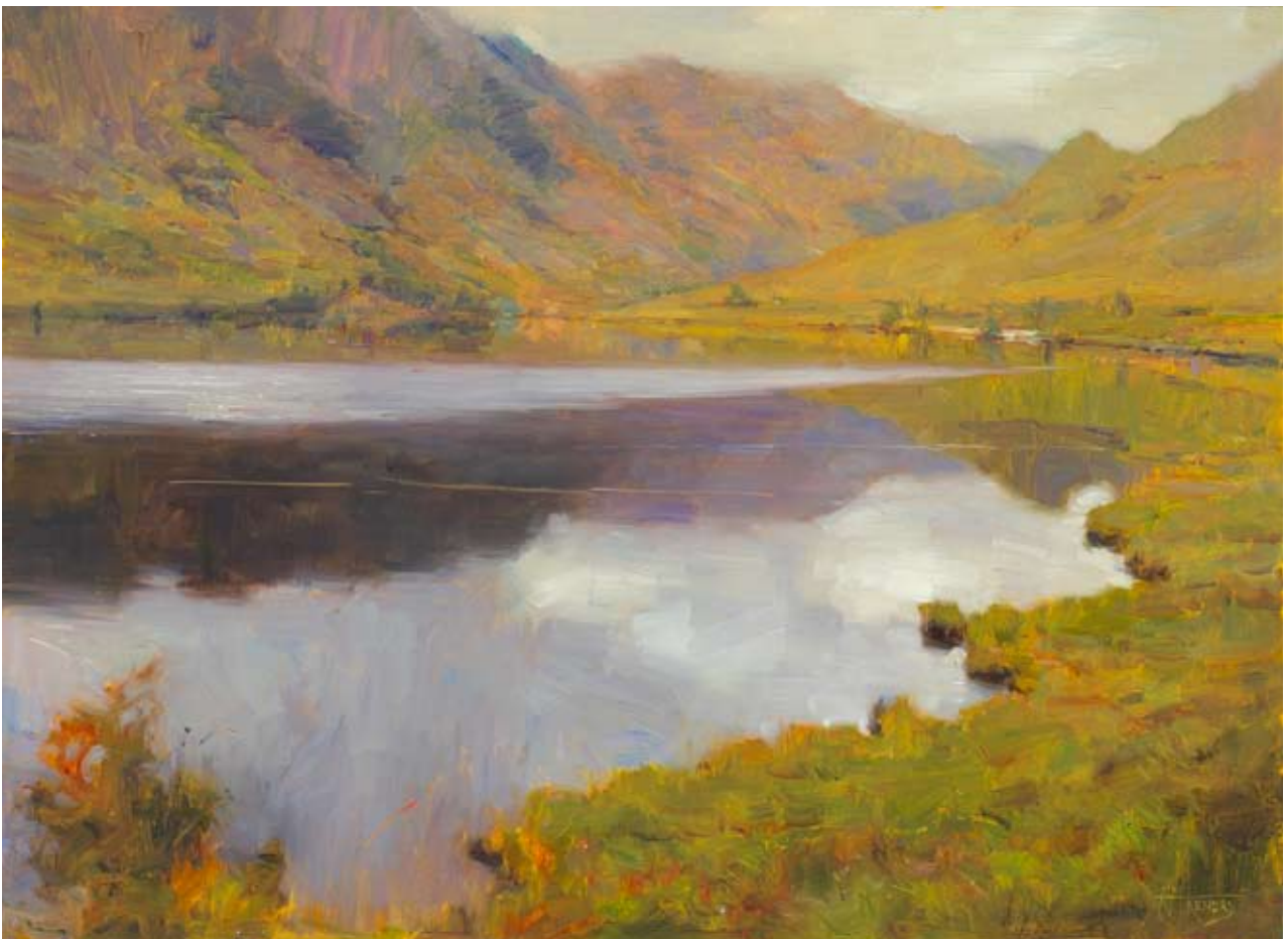
9. LAKE SHORE

Living in Belfast he exhibits regularly at the Royal Ulster Academy. He has executed many private and public portrait commissions and paintings by him are in the permanent collections of the Department of the Environment of Northern Ireland; The Arts Council of Northern Ireland; Laganside High Court, Belfast; The University of Brighton and the Aldrich Collection, Brighton.