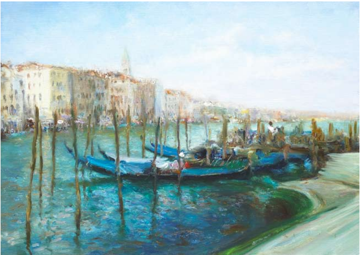
39. VIEW FROM SANTA MARIA DELLA SALUTE, VENICE