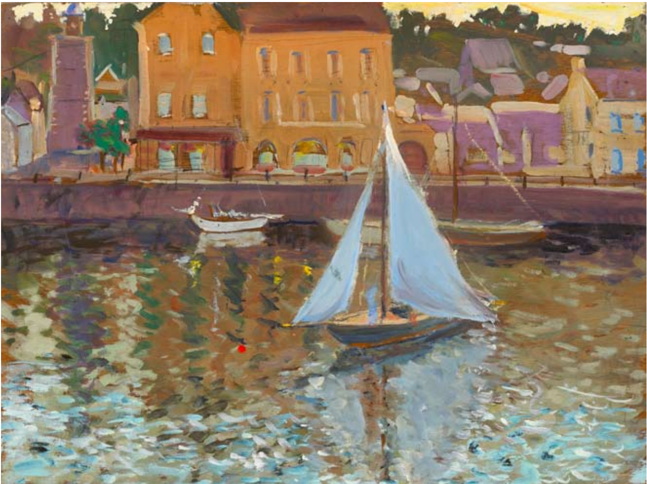
20. ALLEN'S QUAY, YOUGHAL