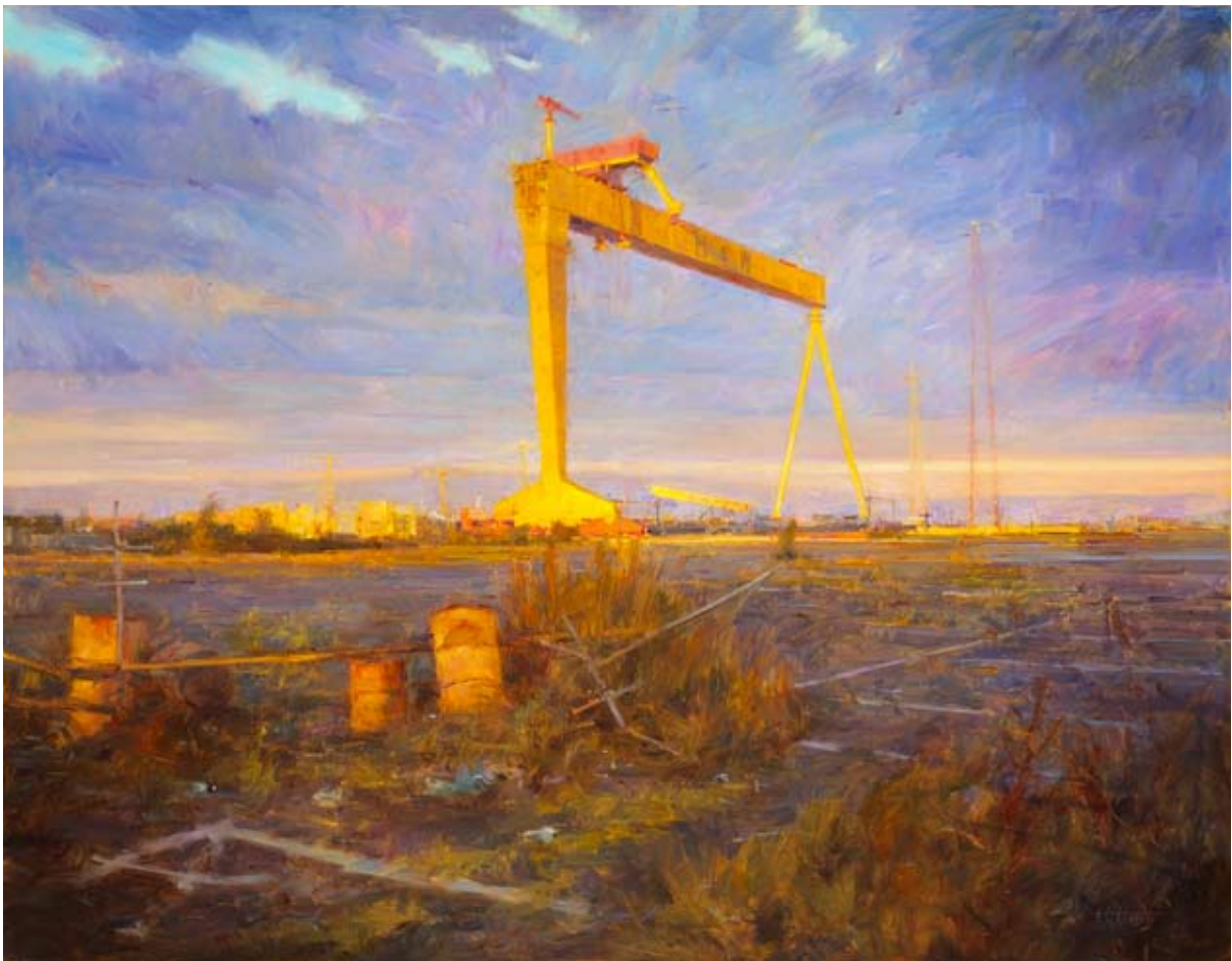
8. BELFAST DOCKS, TITANIC QUARTER