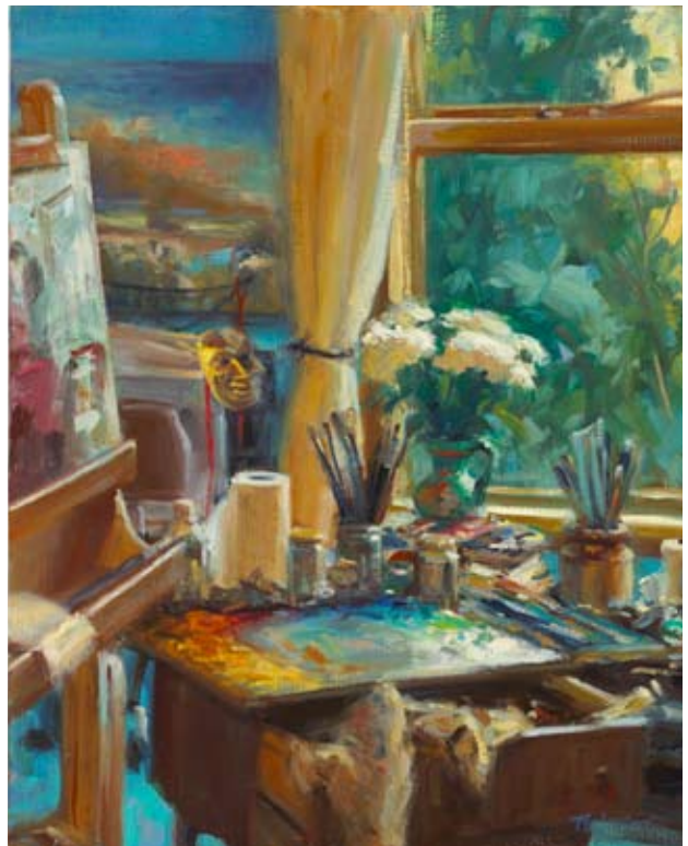
15. NORMAN TEELING