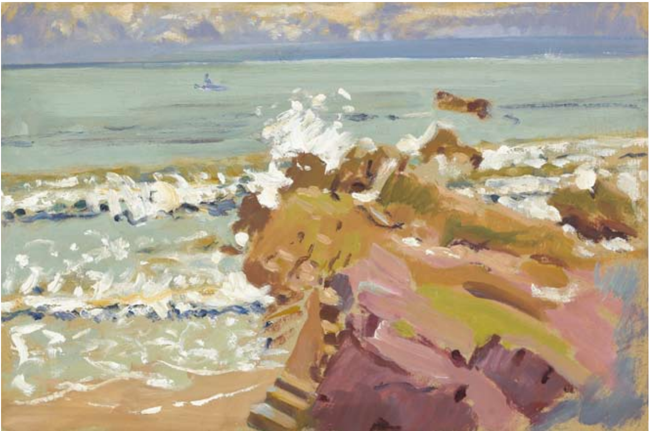
22. ROCKS, FRONT STRAND, YOUGHAL