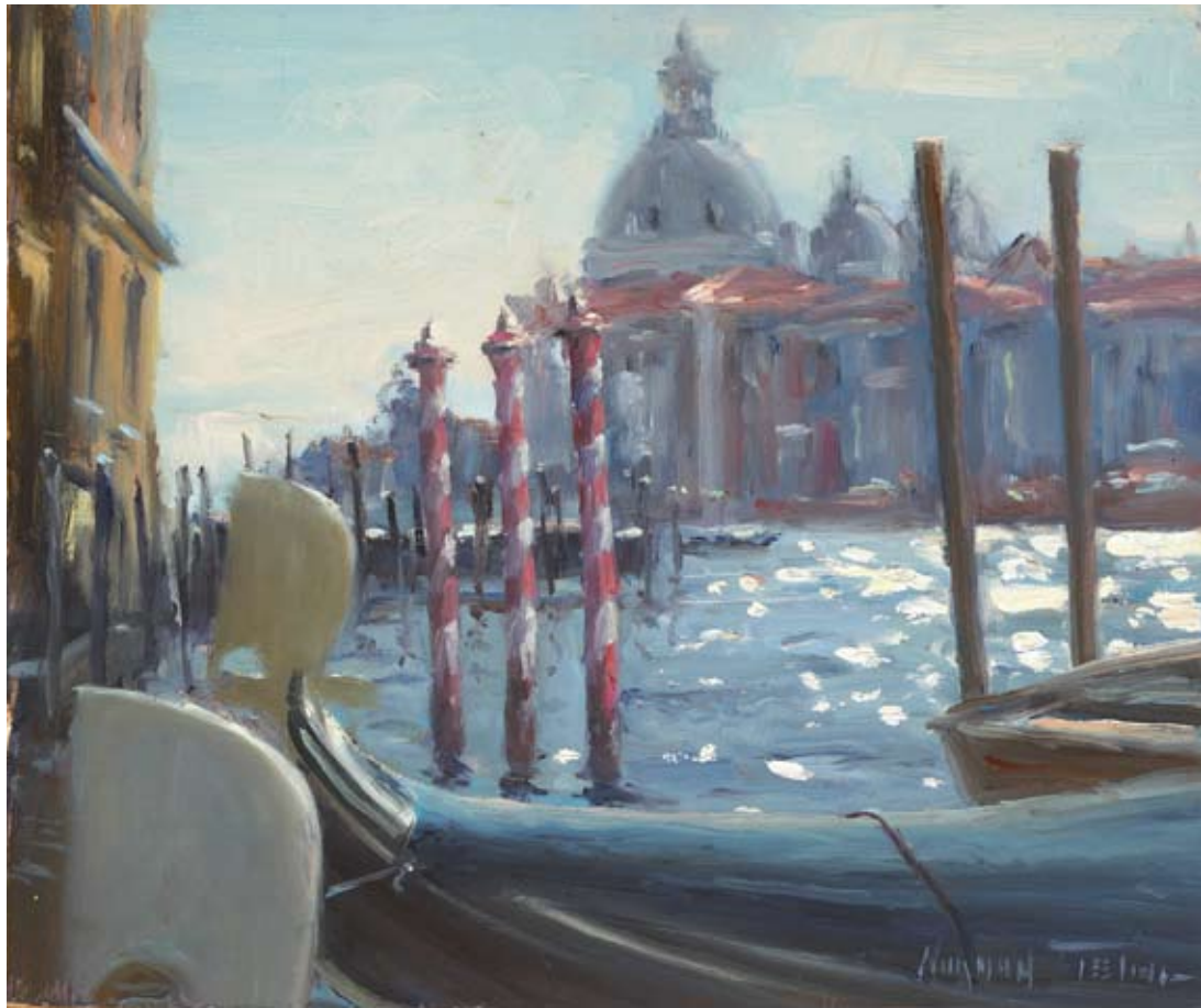
12. THE GRAND CANAL, VENICE