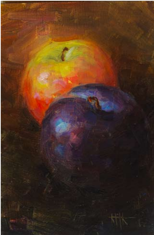
52. KENNY McKENDRY

54. 'North County Dublin' Oil on board 6 x 9