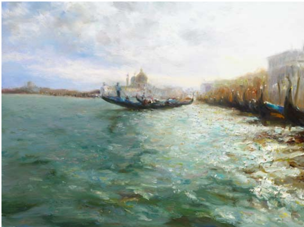
41. BACK TO THE PIAZZETTA, VENICE