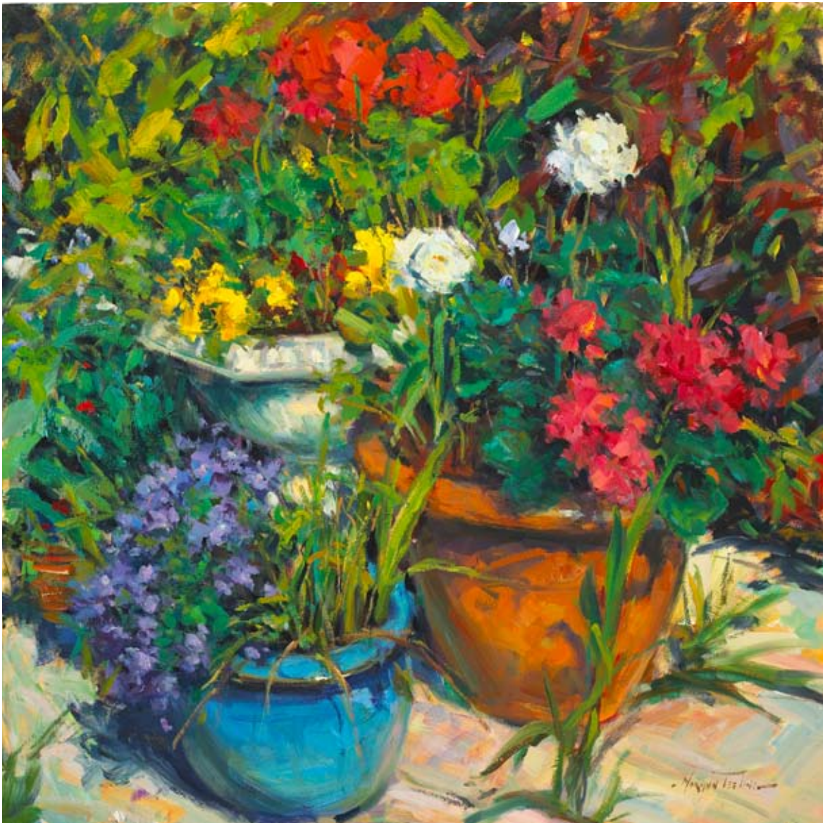
11. FLOWER POTS, THE ARTIST'S GARDEN

The move from a more restricted studio form of painting to a looser brush style and freer expression of impressionism has become his hallmark