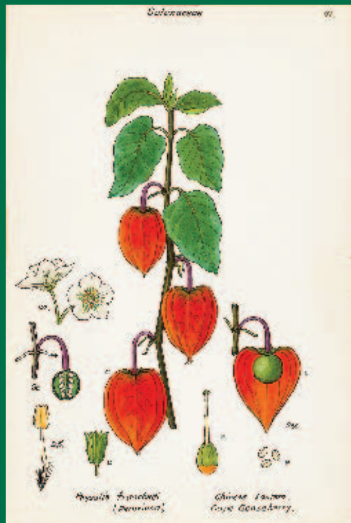
44. CHINESE LANTERN