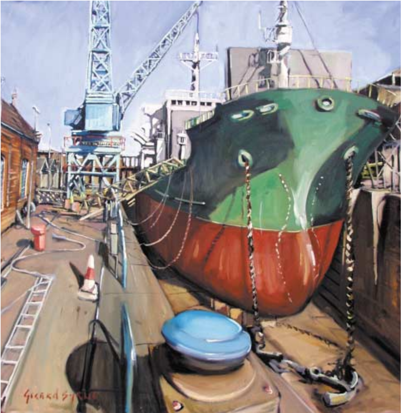
3. 'DRY DOCK, ALEXANDRA BASIN'