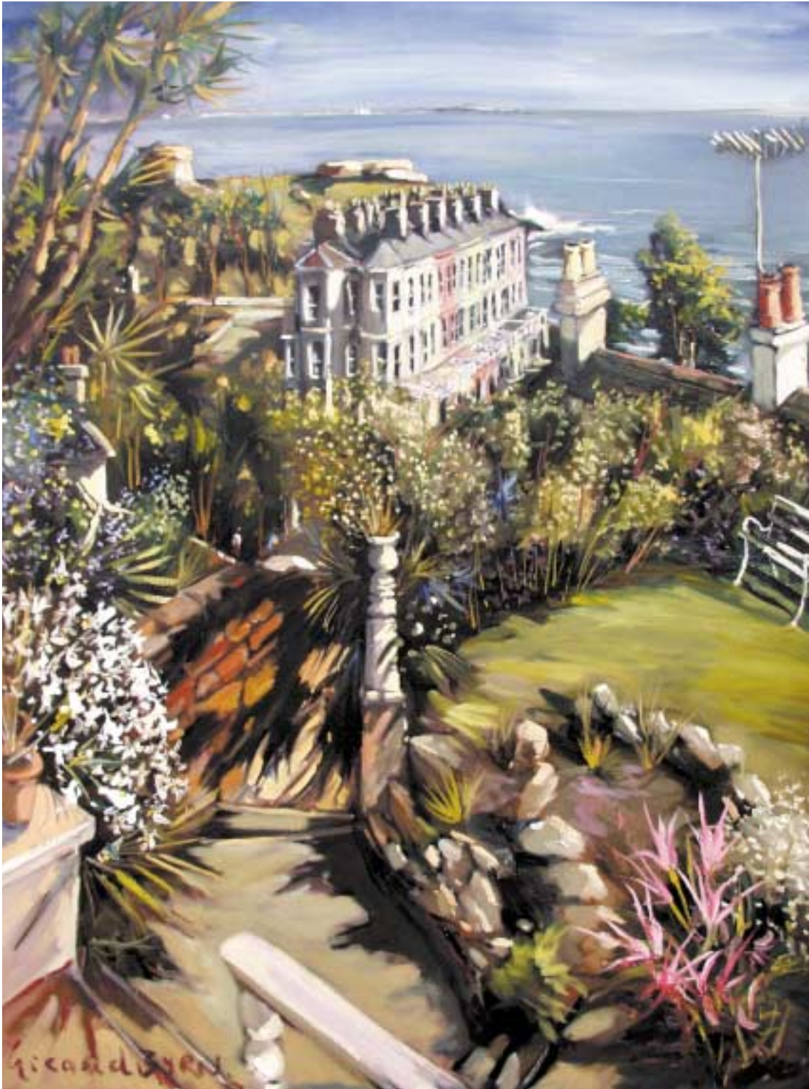
42. 'SORRENTO TERRACE'