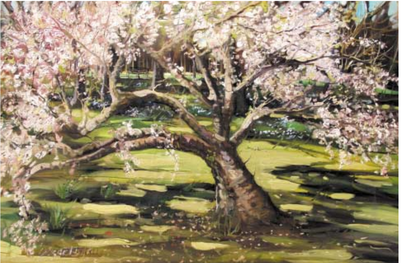
32. 'JAPANESE CHERRY BLOSSOM'