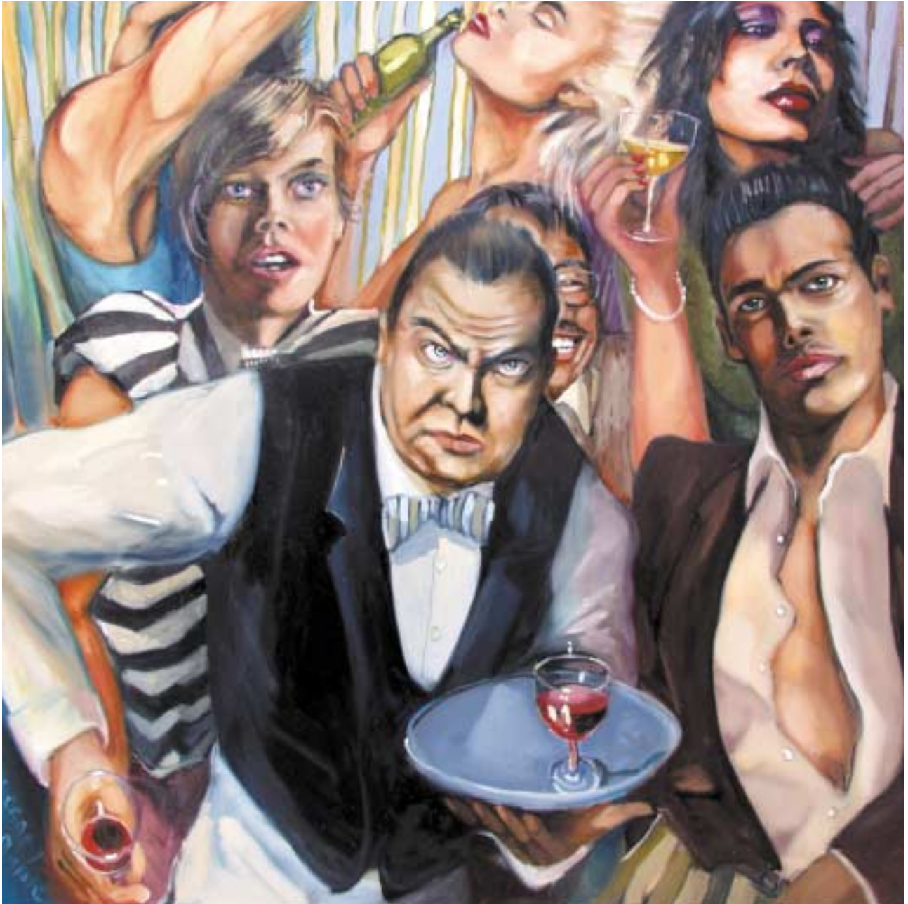
11. 'COCKTAIL WAITER'