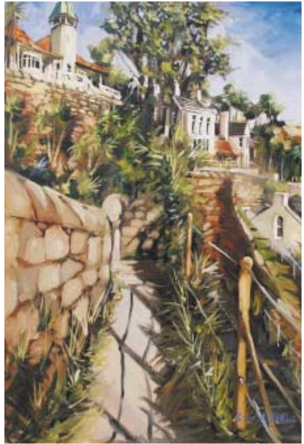
44. 'PATHWAY, VICO ROAD'