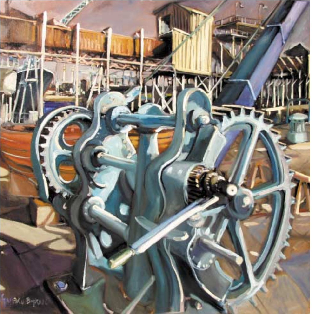
8. 'DAVIT, DUBLIN DOCKS'