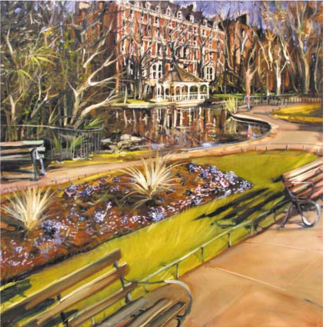
41. 'THE SHELBOURNE HOTEL'