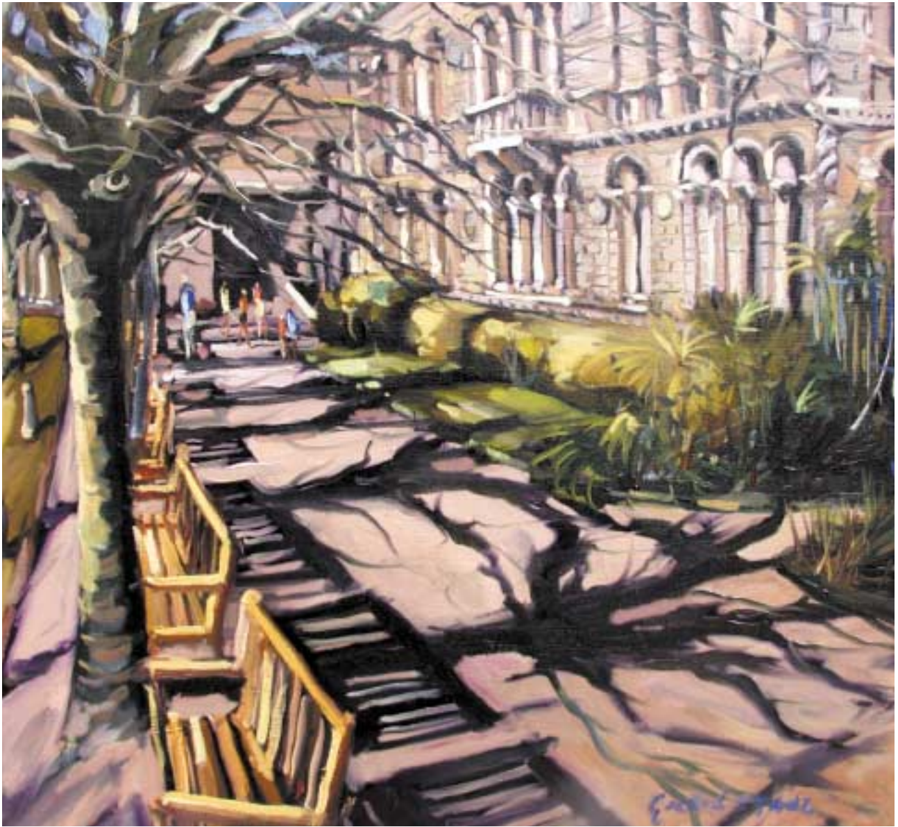
20. 'PATH, TRINITY COLLEGE'