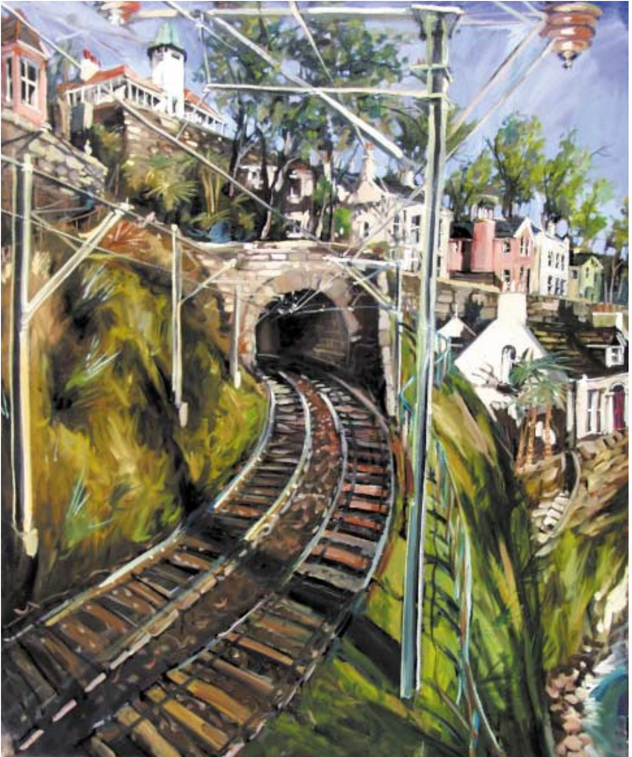
17. 'RAILWAY LINE, VICO ROAD'