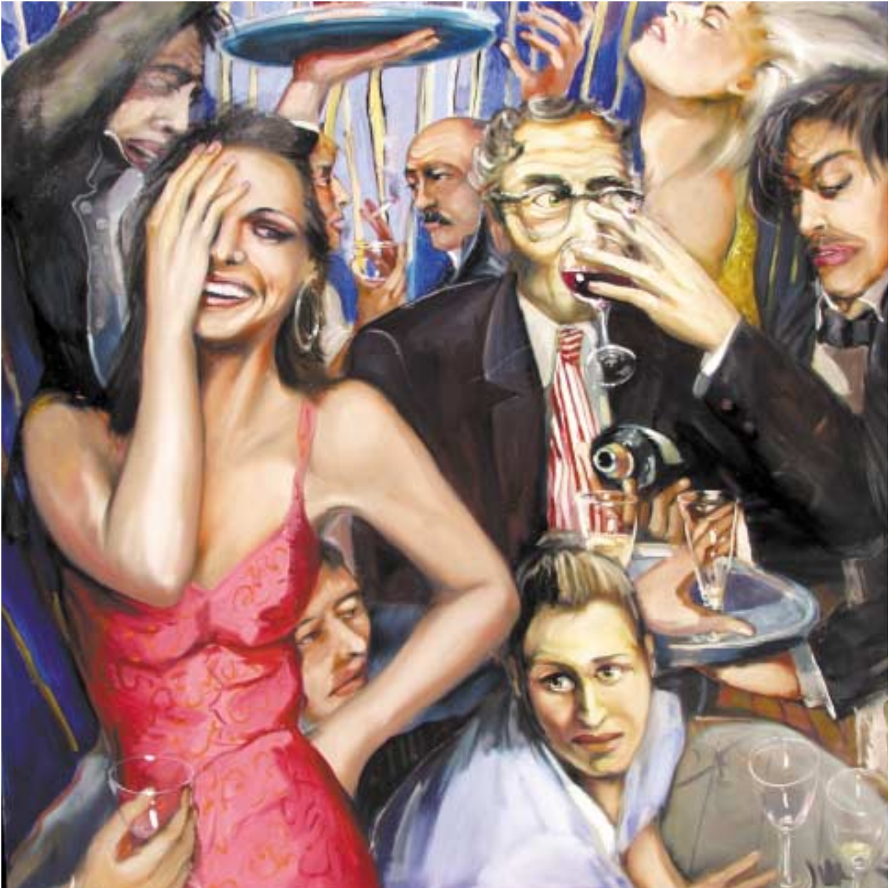
13. 'COCKTAIL PARTY'