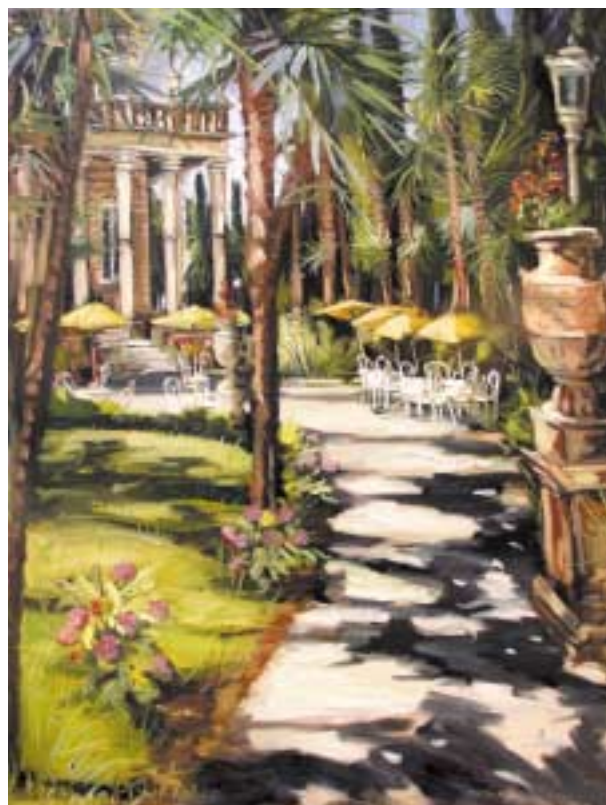
33. 'VILLA CORTINA, LAKE GARDA'