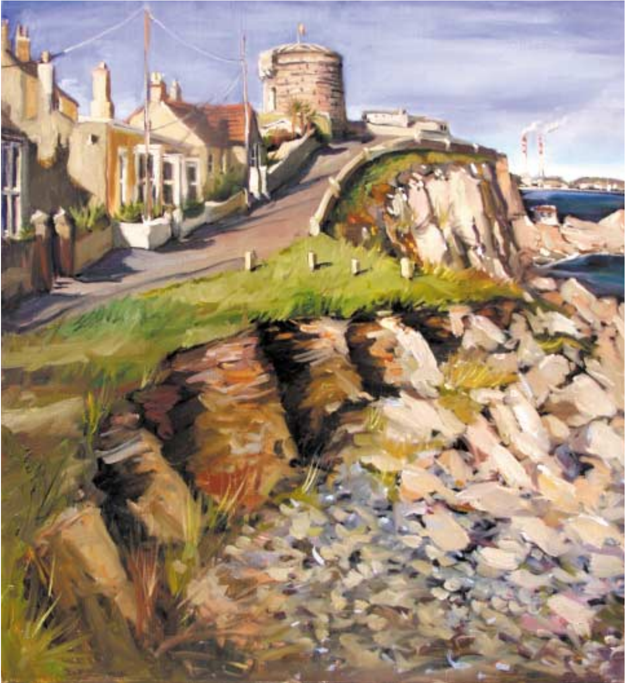
19. 'JAMES JOYCE TOWER, SANDYCOVE'