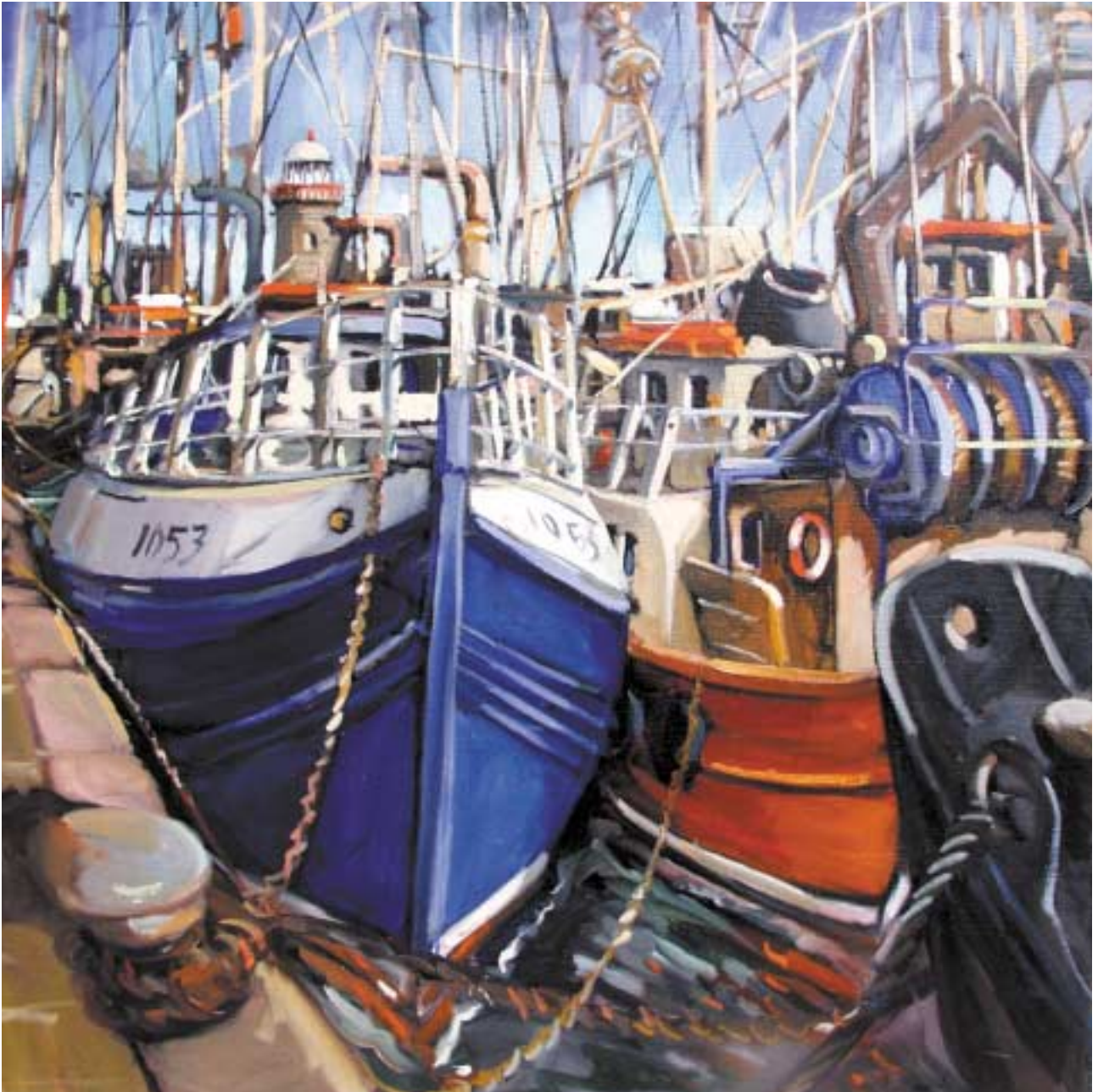
36. 'FISHING FLEET, HOWTH HARBOUR'