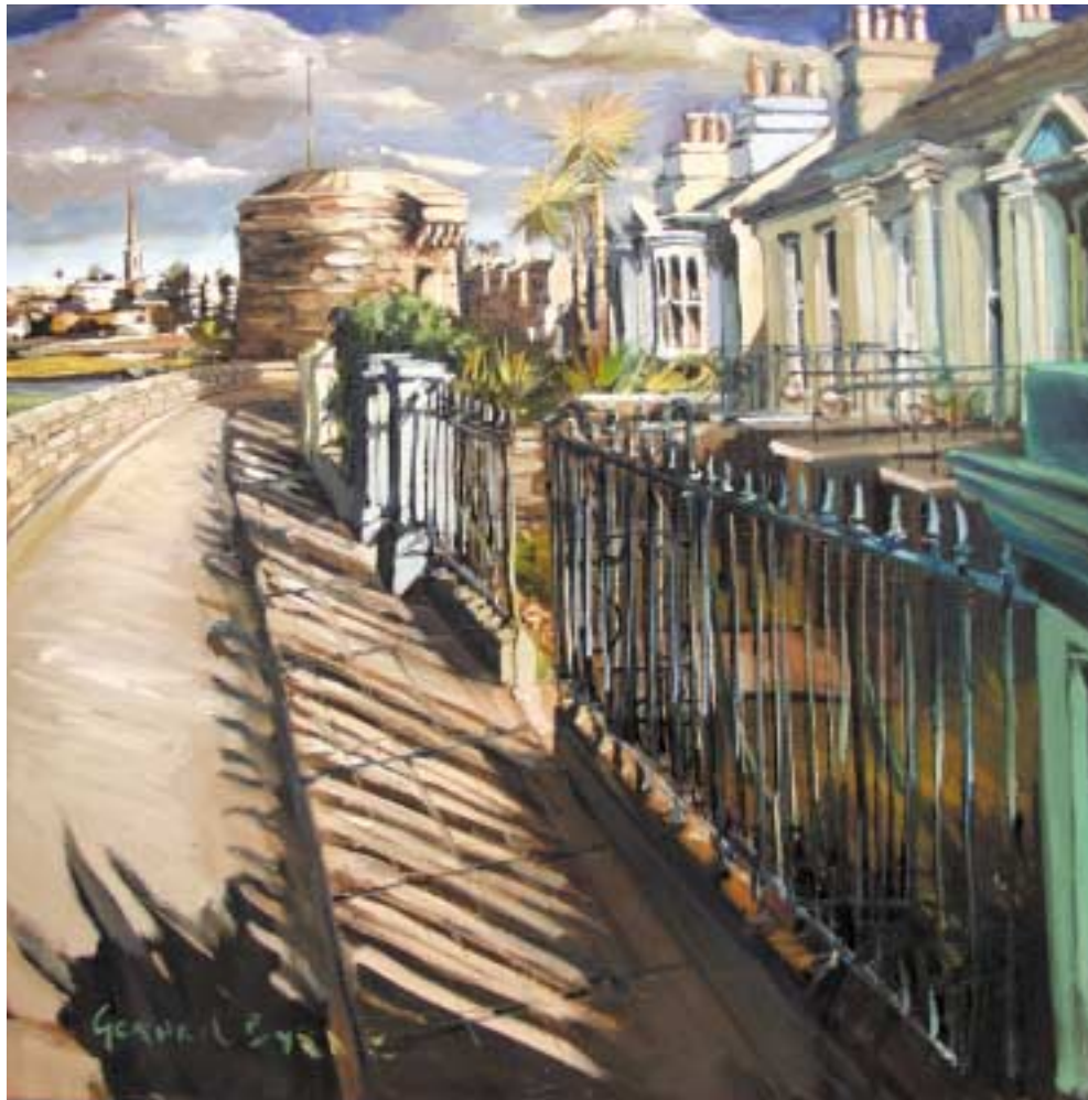
24. 'SEAPOINT, EVENING'