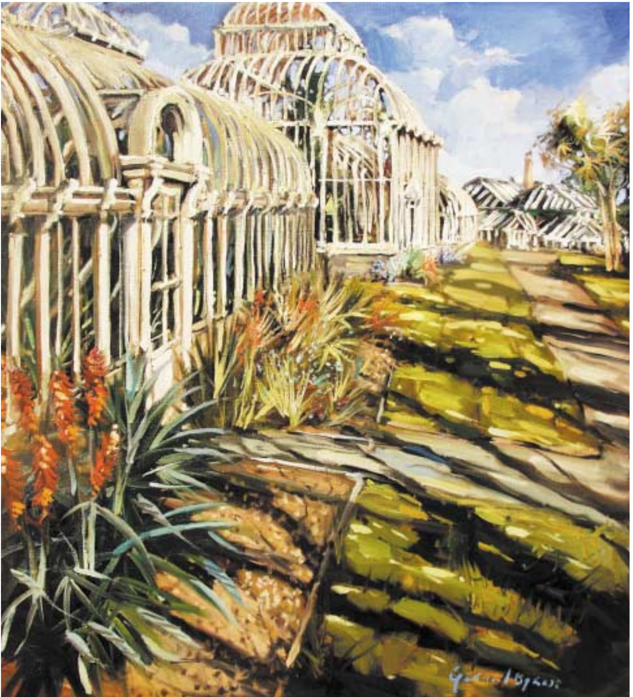
18. 'EVENING LIGHT, BOTANIC GARDENS'