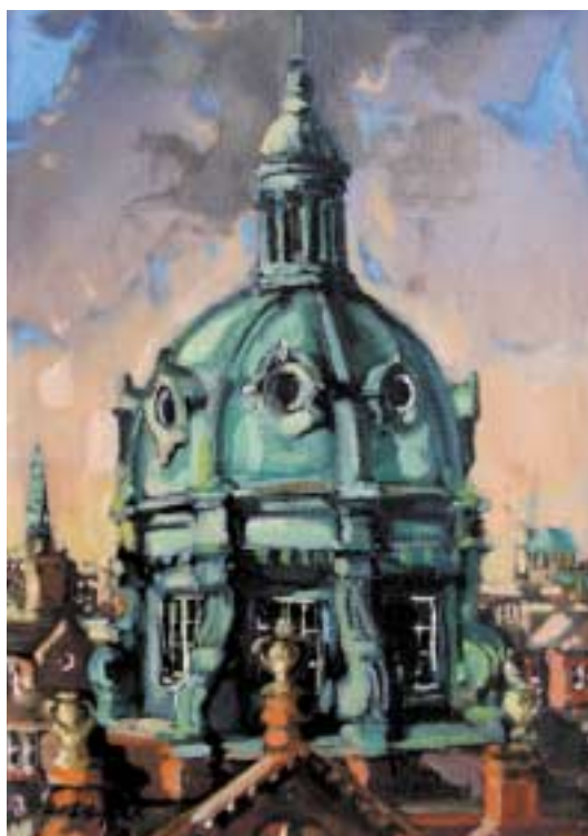
22. 'DUBLIN ROOFSCAPE'