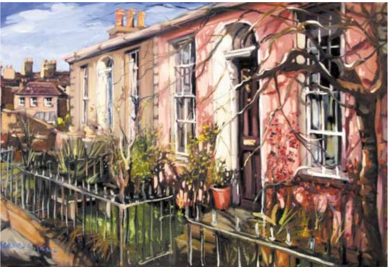
26. A SUNNY TERRACE, SANDYCOVE'