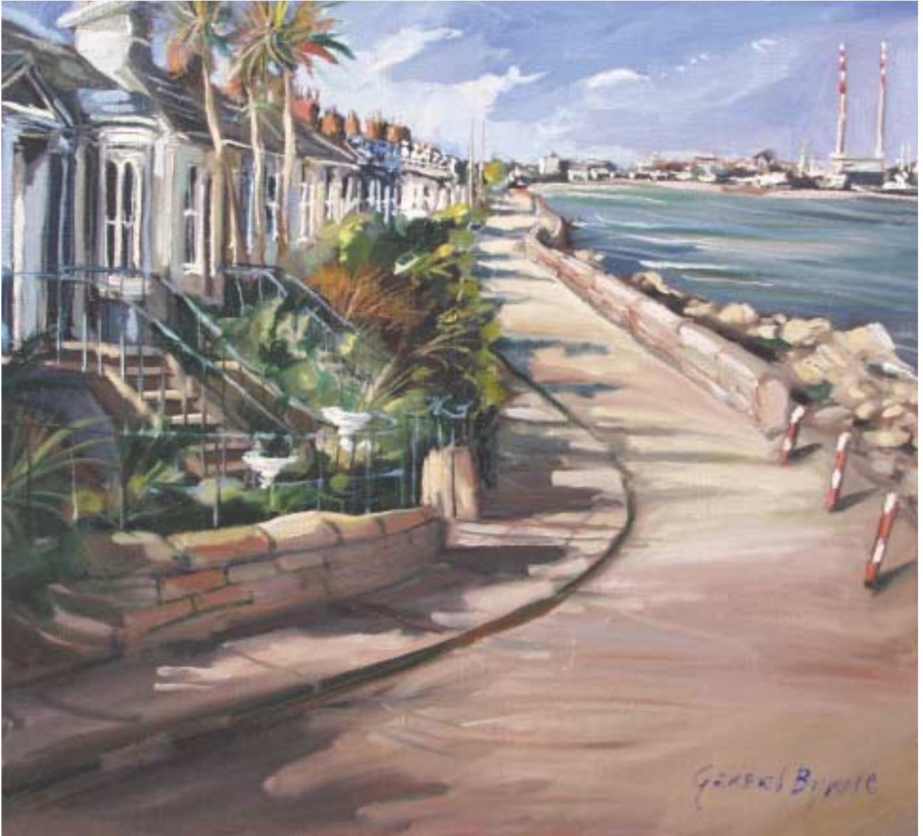
29. 'VIEW OF RINGSEND FROM SEAPOINT'