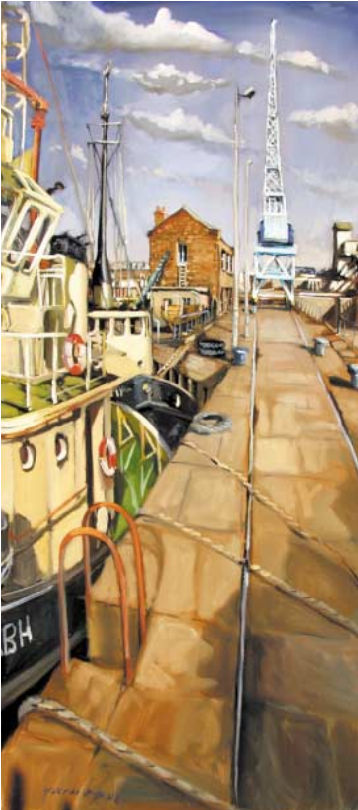
9. 'CLUAIN TARBH AND BEN EADER TUGBOATS'