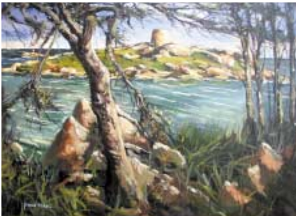
16. 'DALKEY ISLAND'