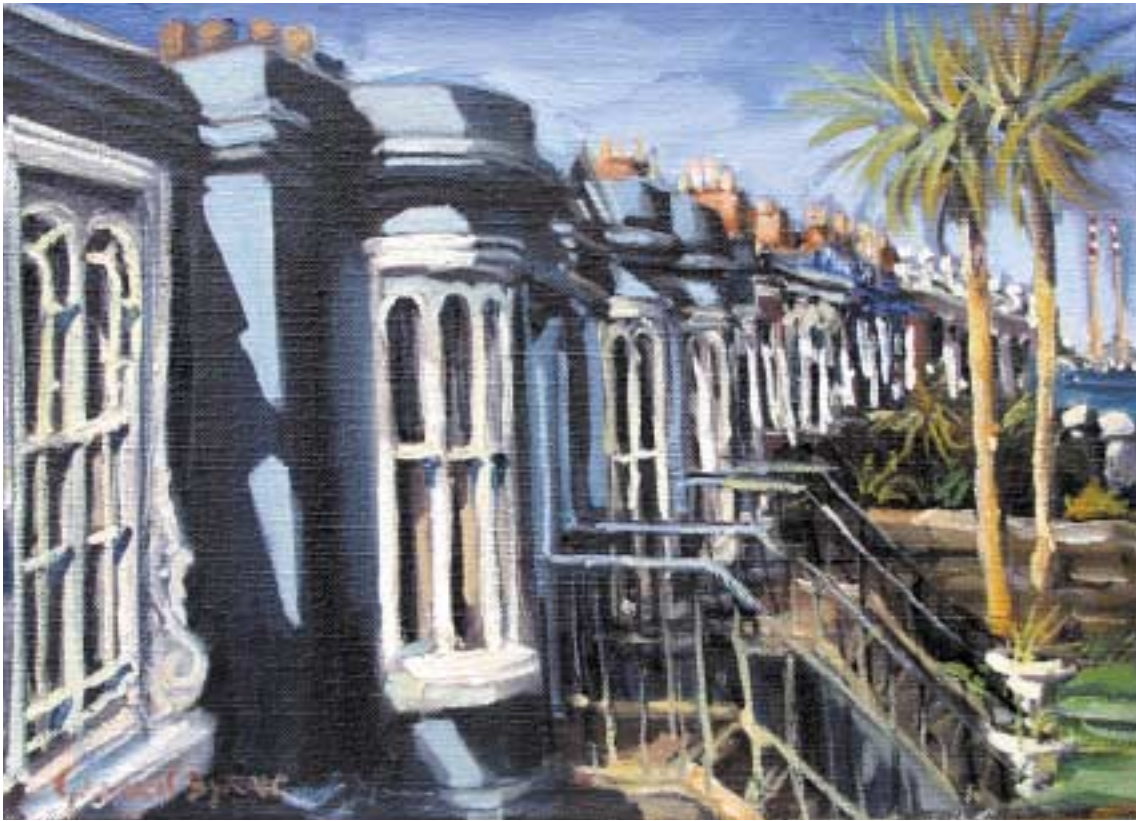
37. 'COAST ROAD, SEAPOINT'