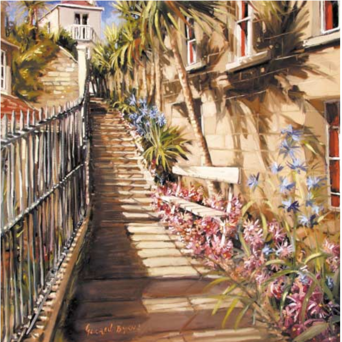
7. 'STEPS, VICO ROAD, DALKEY'