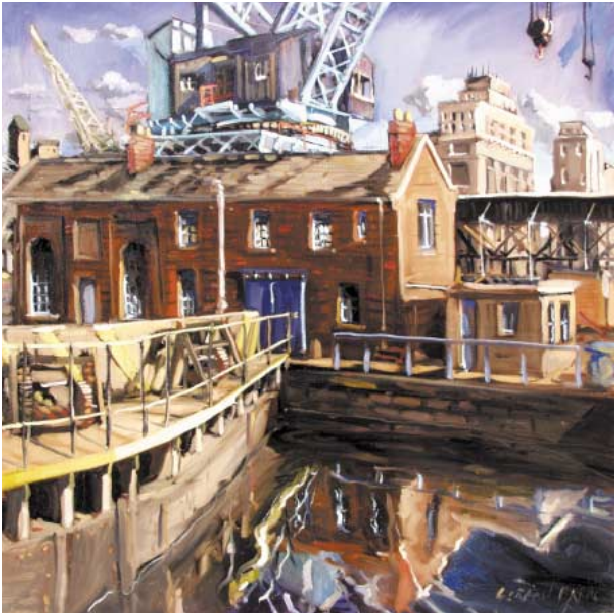
10. 'LOCK, ALEXANDRA BASIN'