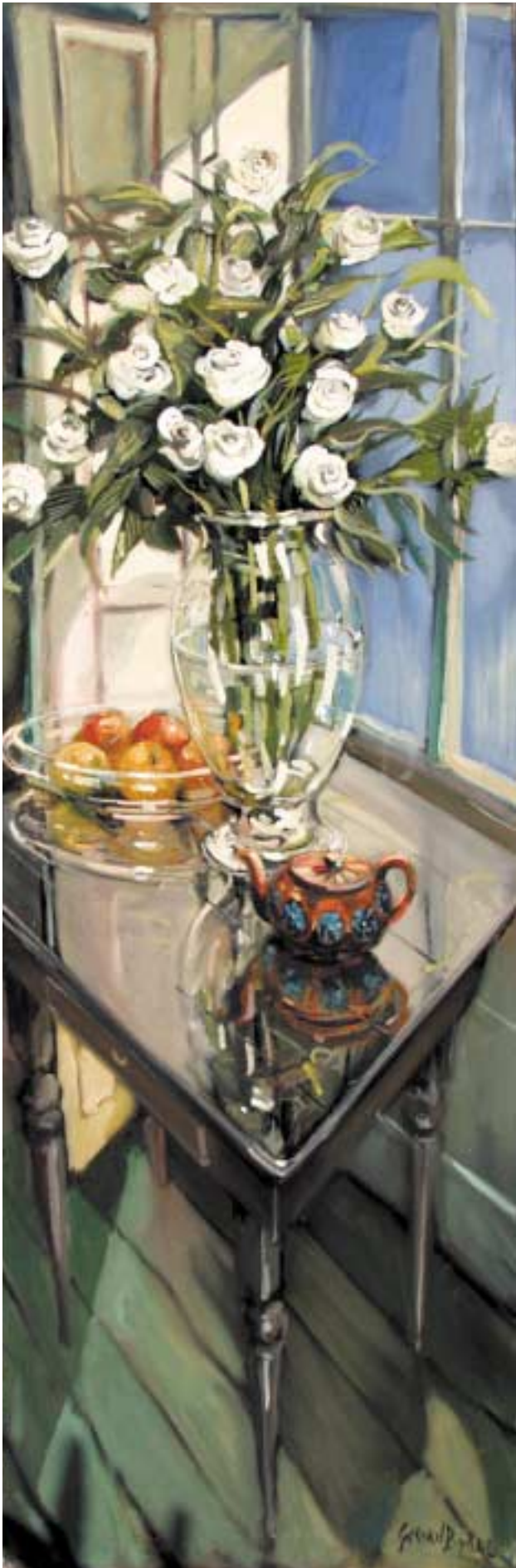
12. 'WHITE ROSES'