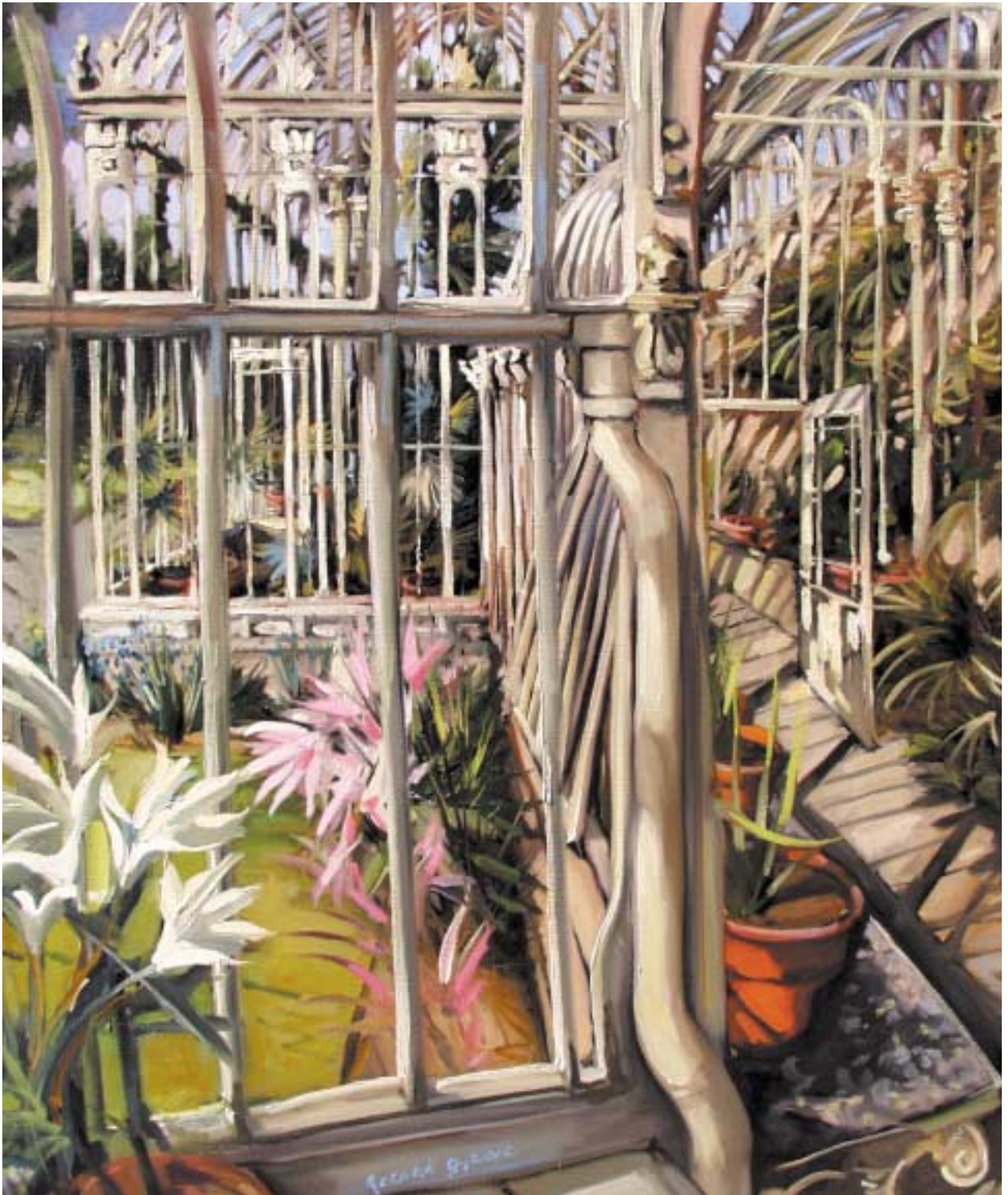
15. 'RHODODENDRON HOUSE, BOTANIC GARDENS'