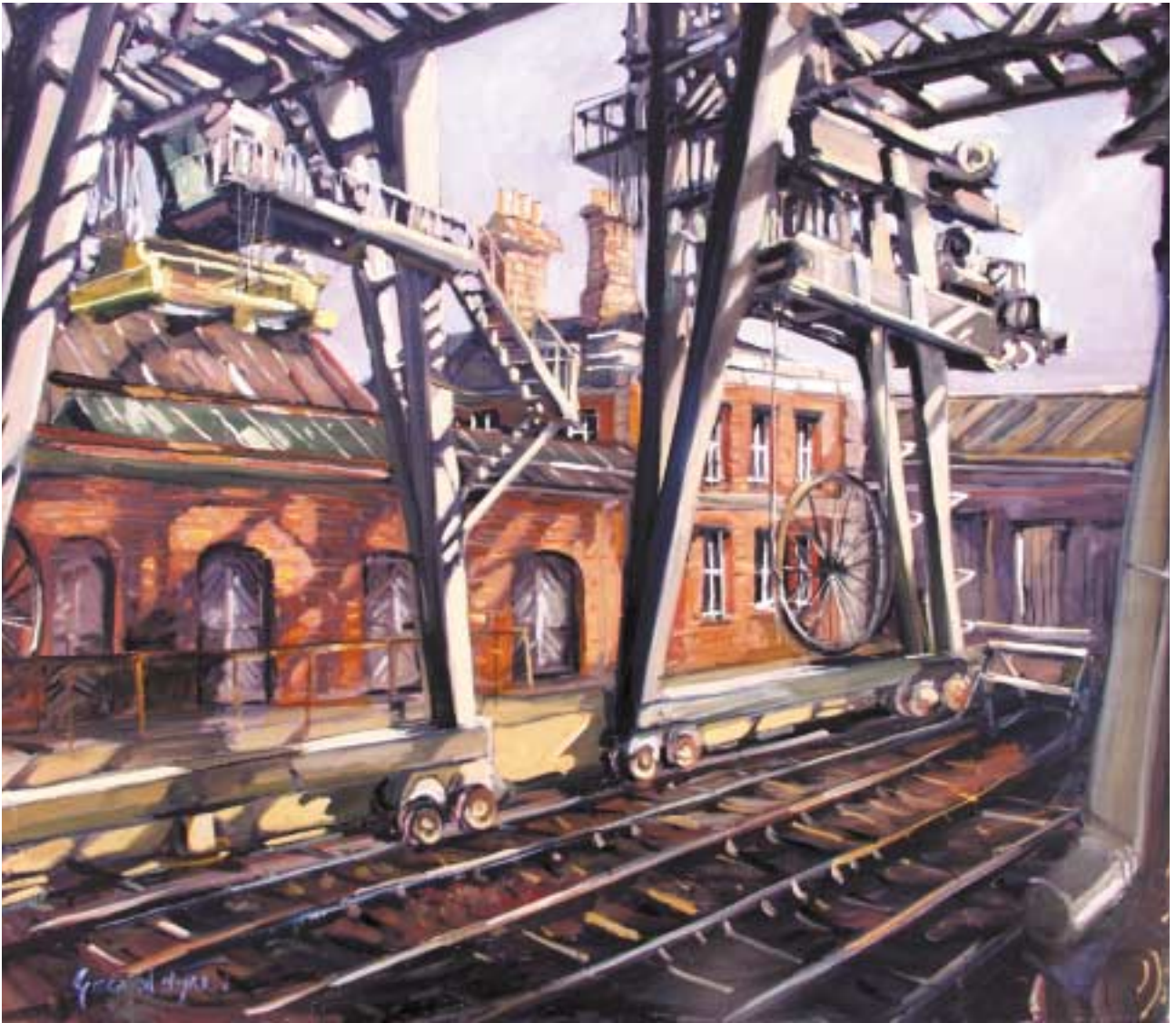
4. 'CRANES, BRITISH RAIL YARD, DUBLIN DOCKS'