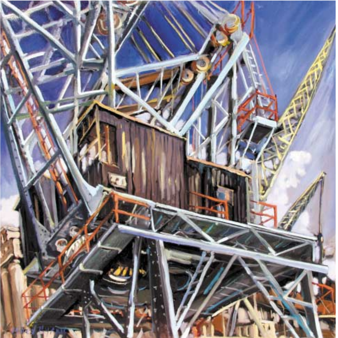
2. 'CRANE, DUBLIN DOCKS'